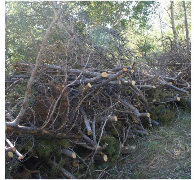
Most efficient: butts to the road